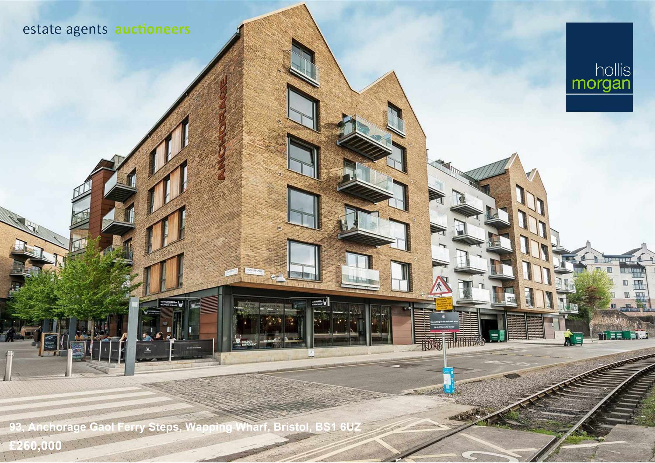
93, Anchorage Gaol Ferry Steps, Wapping Wharf, Bristol, BS1 6UZ